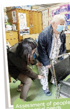
Assessment of people with special needs