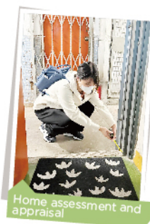
Home assessment and appraisal

Rehabaid Society is a registered charitable organization. We offer a fee deduction or waiver to the applicant, subject to their financial & living condition.