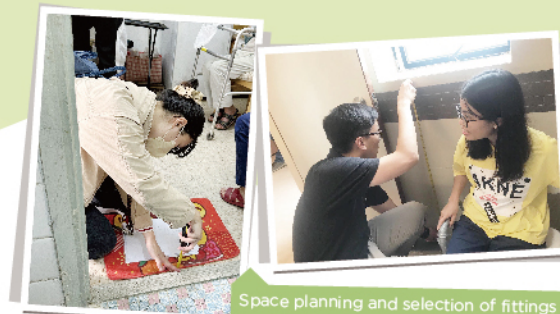
Space planning and selection of fittings

Appropriate home renovation can reduce the occurrence of accidents and improve the quality of life of elders or PWDs. Our professional team can provide the assessment report for the matters related to the adaption work and flat transfer.